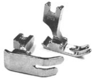
Up Tail Feet