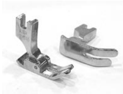
Standard Feet for Needle Feed