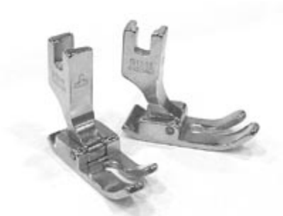
Standard Feet for Heavy Duty