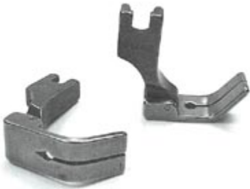
Up Front Feet (Double Toe Even)