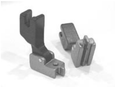
Up Tail Feet for Knitting