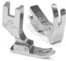
Narrow Feet for Heavy Duty