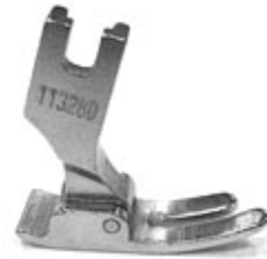
Standard Feet for Heavy Duty