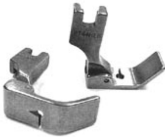
Up Front Feet (Hole in Center)