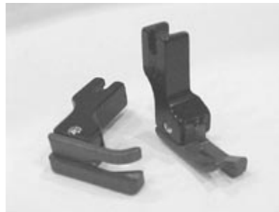
Up Tail Feet (Wide)